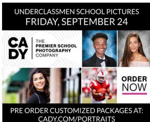
Photo Day for Underclassmen